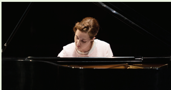
Honors Recital performance, May 8, 2017.

Call (815) 280-2200 to reserve your ticket. No purchase necessary to attend the concert.