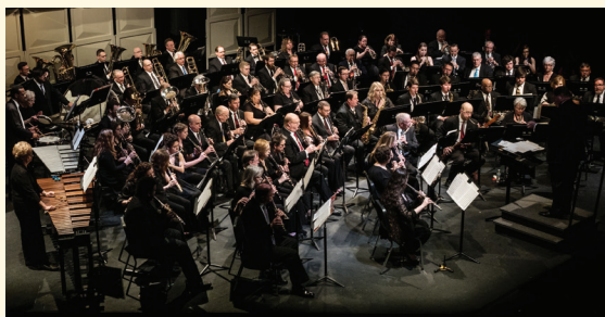
The JJC Community Band performed on May 7, 2017.

MadriGala is $15. Call (815) 280-2200 to reserve your ticket. Reservations required by Dec. 5, 2017.