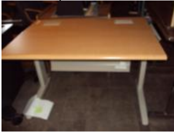
#40 – computer workstation