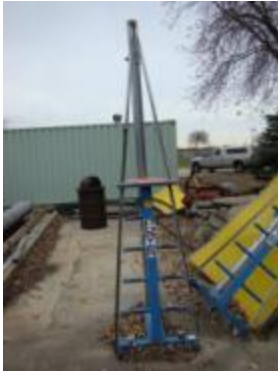
#79 – Referee Stand