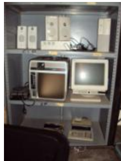
#22 – misc. electronics