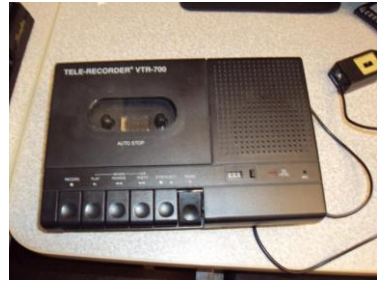
#57 – Tele-recorder VTR-700