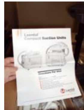
#30 Laerdal compact suction unit