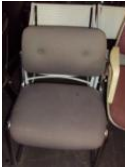
#48 – brown chair