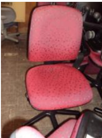
#82 – Red office chair