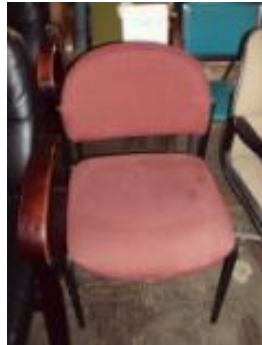
#49 – Pink Chair