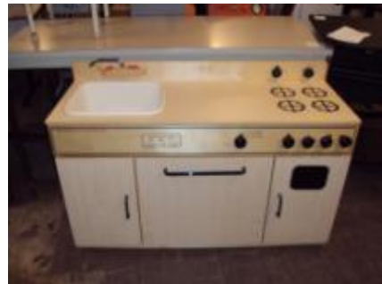
#80 – Play Kitchen