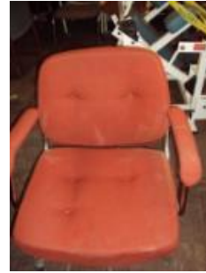
#43 – chair on wheels