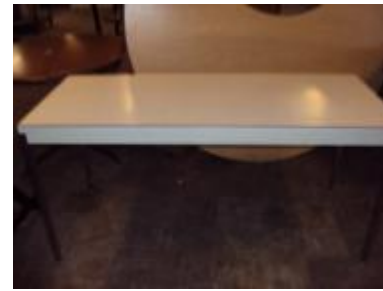
#27 – Rectangular table