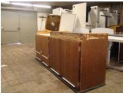
#104 – Wooden cab w/black top