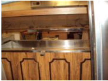
#56 – Salad bar