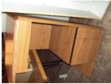
#26 – Small Wood Desk