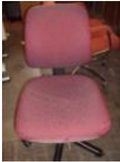
#44 – computer chair