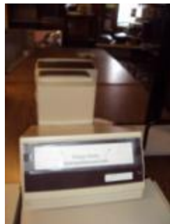
#36 – lot of 6 disk holders