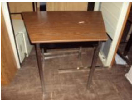
#120 – Small Table