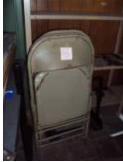
#112 – Folding Chairs