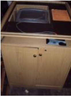
#114 – Media station