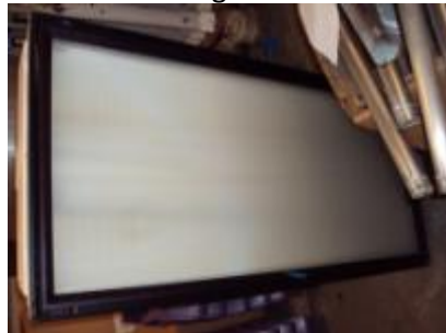
#108 – Lg Fluorescent fixtures