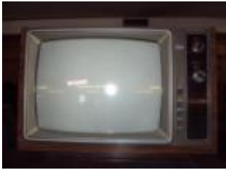
#1 – RCA 19" TV