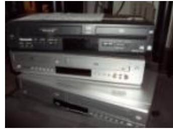
#7 - VCR/DVD combos