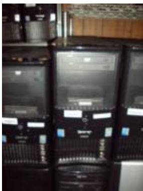
#87 – Lot of CPU's