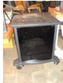
#13 – Media cabinet