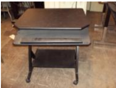
#28 – Computer desk on wheels