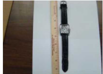
#18 – Wrist watch