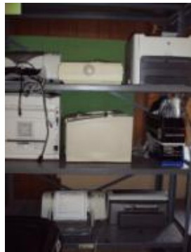
#118 – Lot of Scanners / Printers