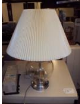
#115 – Glass Lamp