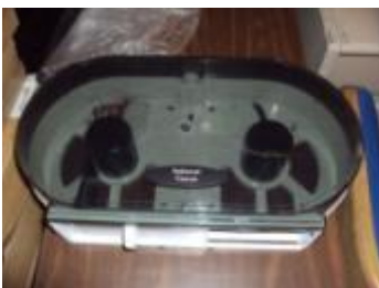
#20 – Toilet paper dispenser