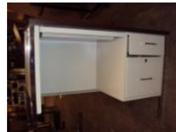
#35 - Small metal desk