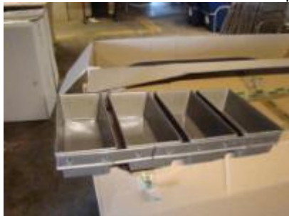
#107 – Commercial bread pans