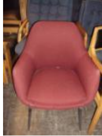
#42 – maroon chair