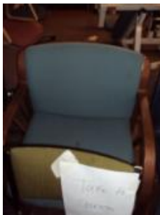
#51 – Lg. Blue Chair