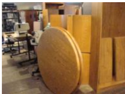
#95 – Round tables w/pedestal bases