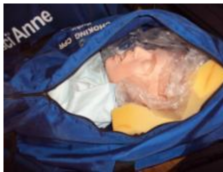
#88 – Resuci Anne CPR Dummy