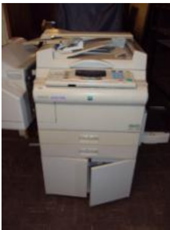
#81 – Savin 9027 DL Copier