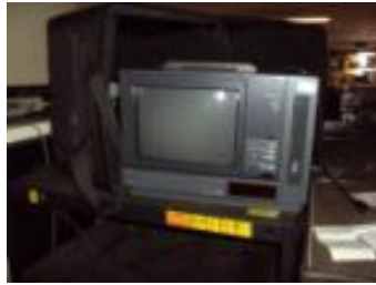
#5 – Portable TV/VCR