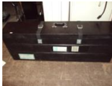
#29 – Display Boards in case