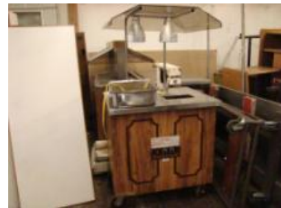
#106 – Food Carving Station