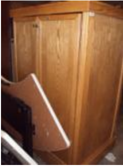
#111 – Lg. Oak Cabinet