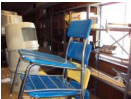
#92 – Stacking Classroom Chairs