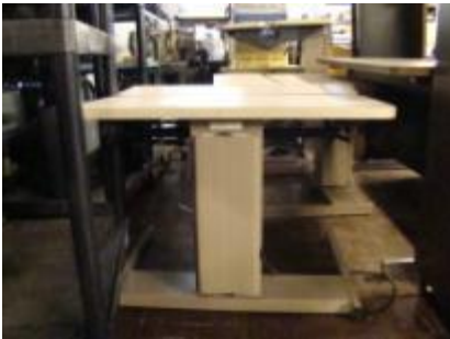
#101 – Adj. tables w/split top