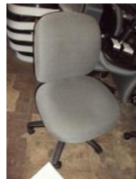
#91 – Grey Computer Chair