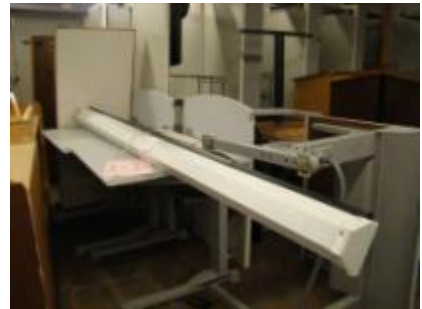
#103 – Da-Lite Model C screen