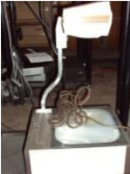
#15 – Overhead projector