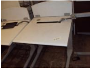
#53 – Grey computer stations