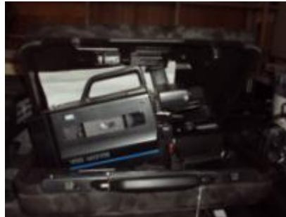
#16 VHS camcorder