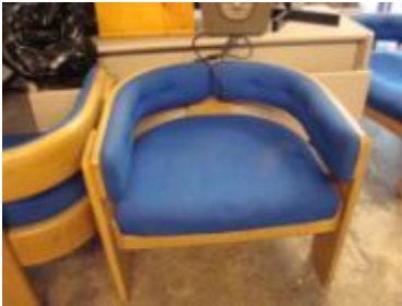
#98 – Round Blue Chairs