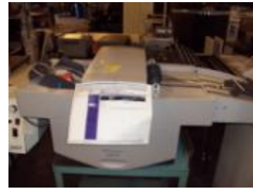
#86 – Paper Folding Machine