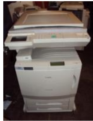
#119 – Canon C2100 Copier