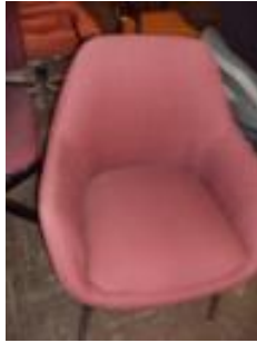
#45 – Pink chairs