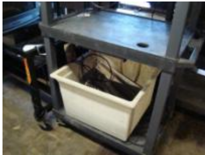
#102 – White Utility Sink