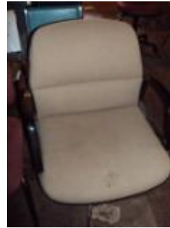
#50 – Brown Chair