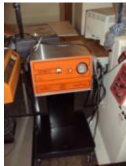
#33 – Comco 3020 aspirator