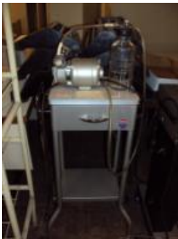
#31 – vacuum unit