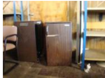
#100 – Small Fridge