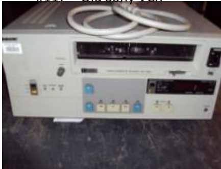
#117 – Old Sony VCR