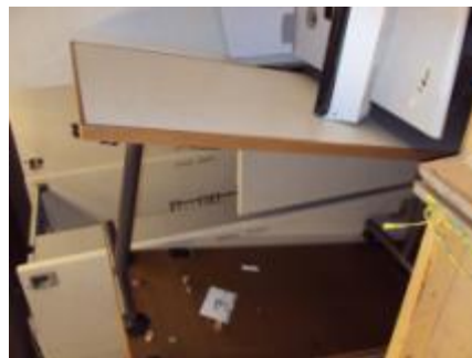
#93 – Rectangular table on castors