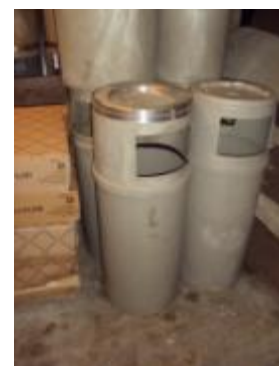
#94 – Garbage Cans