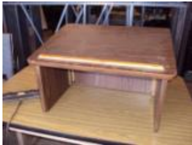
#8 – Podium