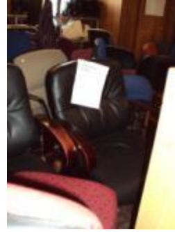
#113 – Black vinyl chairs