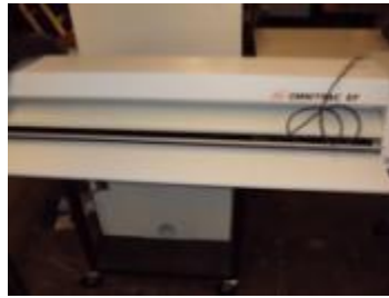
#85 – Omnitrac Blue Print Machine