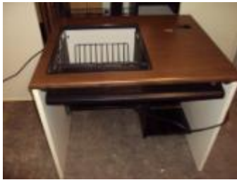
#84 – Computer Station