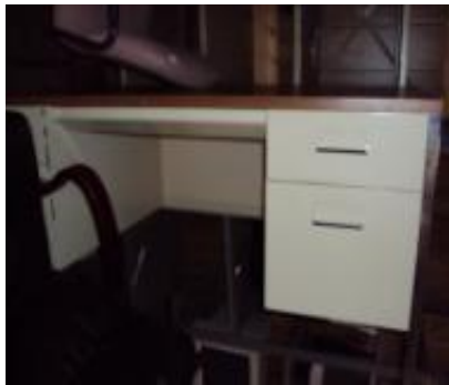
#58 – Office Desk