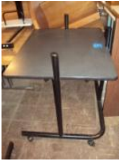
# 25– Desk on wheels