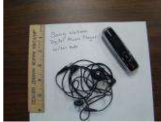
#124 – Sony MP3 w/ear buds