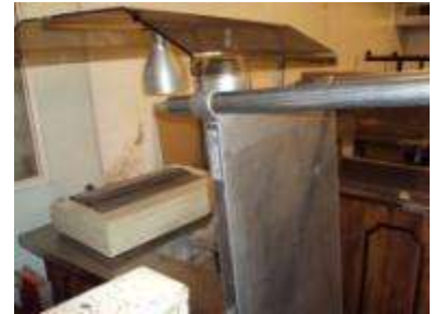
#166 – Food Station w/heat lamps