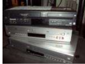
# 15 - VCR/DVD combos