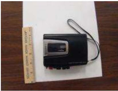
#126 – Sony Cassettecorder