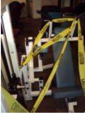
#145 – Magnus fitness System