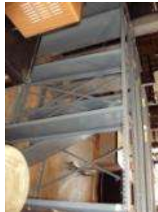
#153 – metal shelving