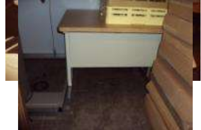
#94 – Small Desk