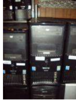
#60 – Lot of CPU's Monitors & Keyboards