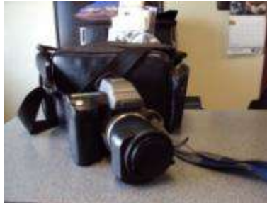
#62 – Sony camera w/case