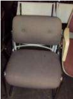
#111 – brown chair