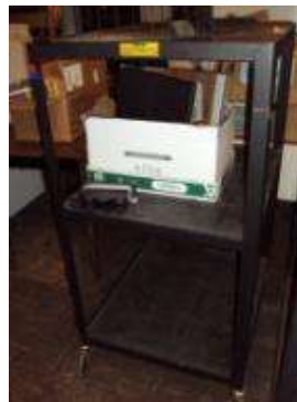
#55 – medium media cart