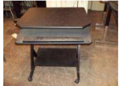
#78 – Computer desk on wheels