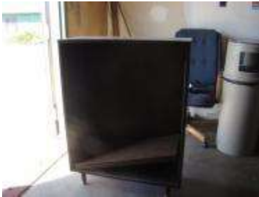
#128 – Small wooden Bookshelf