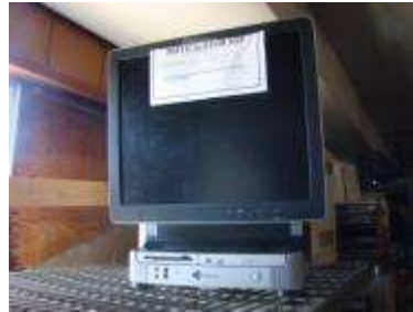
#129 – Gateway Profile Computer