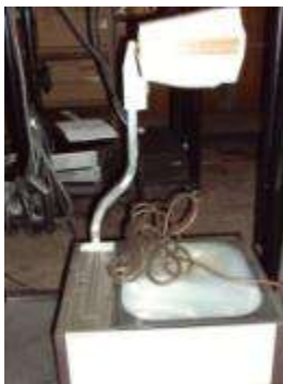
#37 – Overhead projector