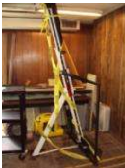
#22 – Versa Climber