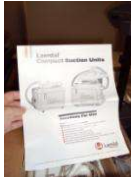
#80 Laerdal compact suction unit