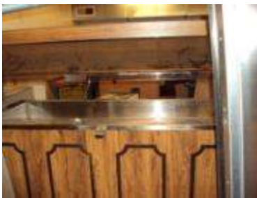
#167 – Salad bar