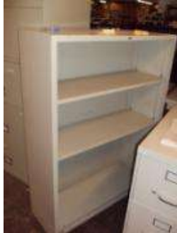
#52 – 3 shelf metal bookshelf