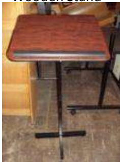
#67 – Wooden Stand