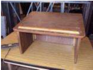
#16 – Podium