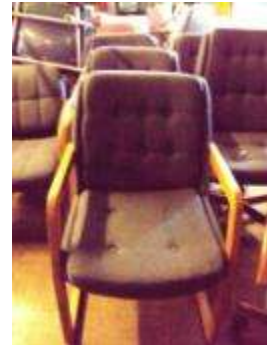
#34 – Stationary blue chair