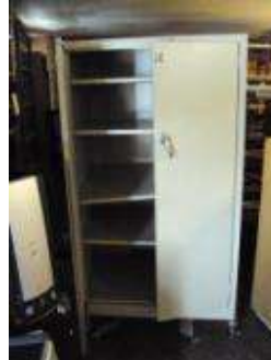
#53 –mobile storage cabinet