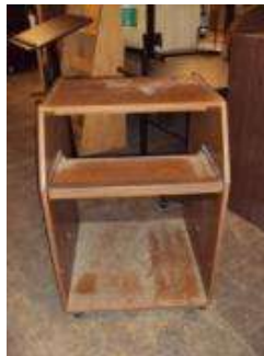
#85 – wood computer desk