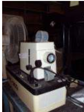
#24 – Film projector