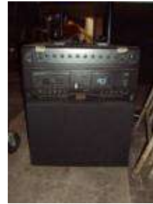
#11 – Karaoke Machine