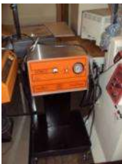
#83 – Comco 3020 aspirator