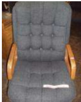
#33 – Lg blue chair