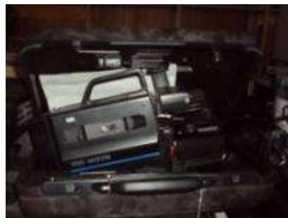
#38 VHS camcorder