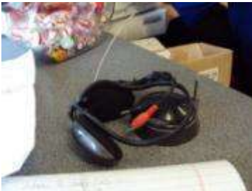
#64 – Wireless FM transmitter