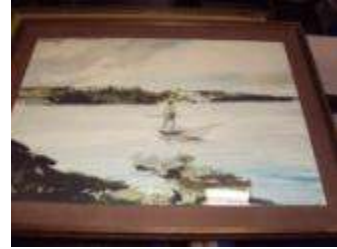
#28 – Scenic Boat Painting