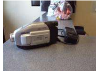
#63 – Panasonic palmcorder