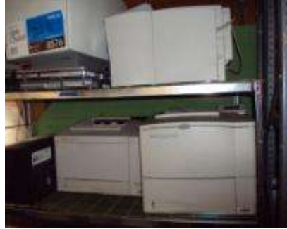
#59 – Lot of Printers / Scanners