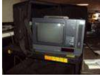
#13 – Portable TV/VCR