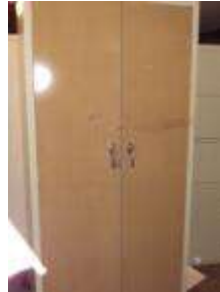
#47 – 2 Door, 5-shelf cabinet