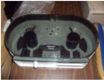
#46 – Toilet paper dispenser