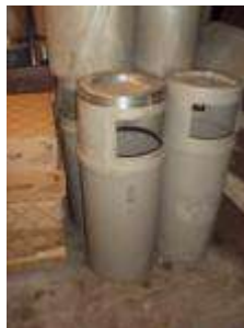
#158 – Garbage cans