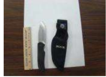
#125 – 3" Buckknife w/sheath