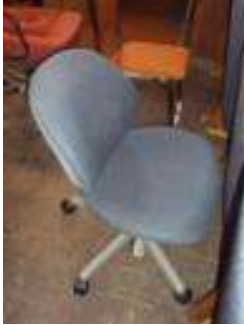
#108 Blue comp. chair