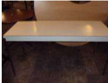
#77 – Rectangular table