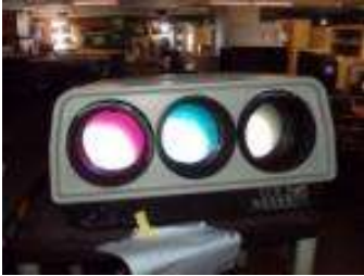
#12 – Projection TV