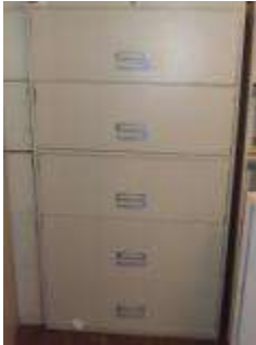
#42 – Lg. 5 drawer file cabin