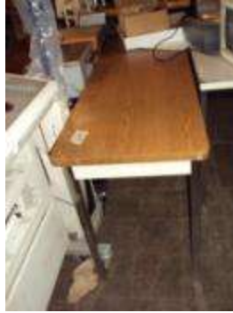
#73 – Rectangular Table