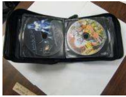
#127 – CD holder w/various CD's