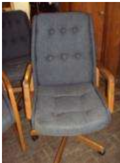
#32 – Lg Blue rolling chair