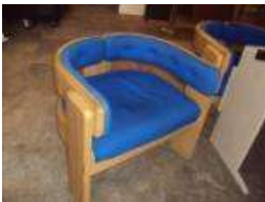
#121 – Blue Chairs