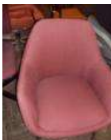
#105 – Pink chairs