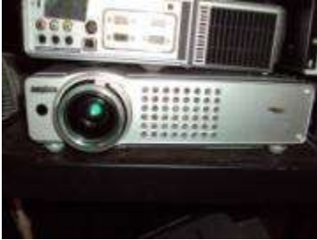
#26 – Video Projection Unit