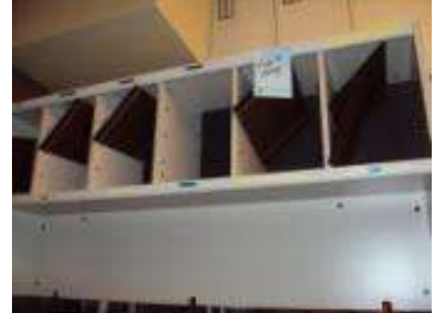
#147 – Shelving Unit