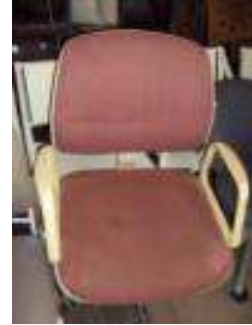
#110 – pink chair