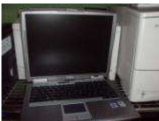
#156 – lot of 4 laptops