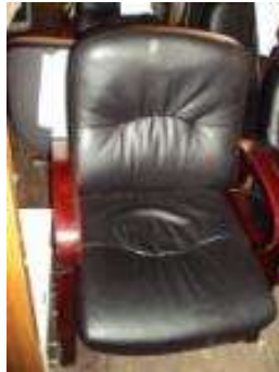
#112 - Black Leather Chair