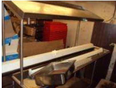
#165 – SS Kitchen Equip.