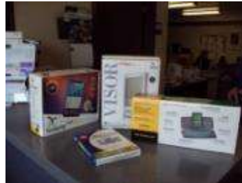
#65 – lot of Visor handspring computers w/software, keyboards.