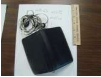
#123 – Bose earbuds w/case