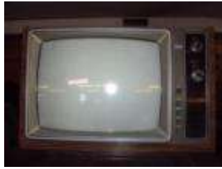
#5 – RCA 19" TV