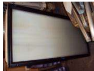
#169 – Light Fixtures