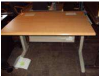
#96 – computer workstation