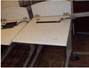
#160 – Grey computer stations