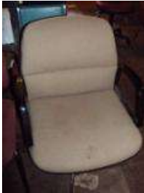
#114 – Brown Chair