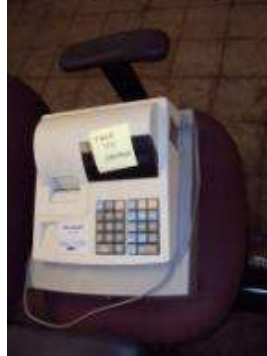
#162 – Sanyo cash register