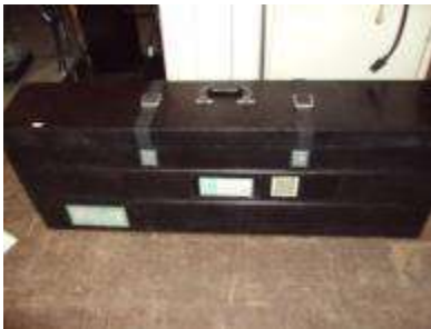
#79 – Display Boards in case