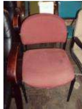
#113 – Pink Chair