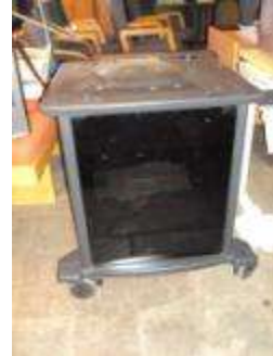
#31 – Media cabinet