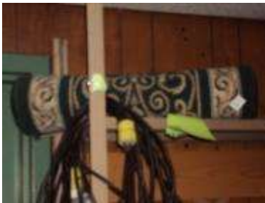
#151 – Green Rug