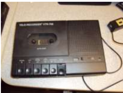
#170 – Tele-recorder VTR-700