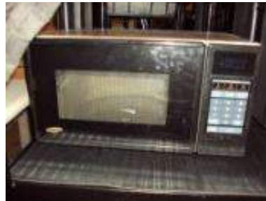
#18 – small microwave