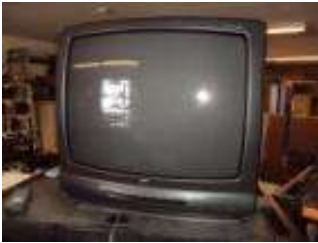
#1 – Zenith 25" TV w/remote