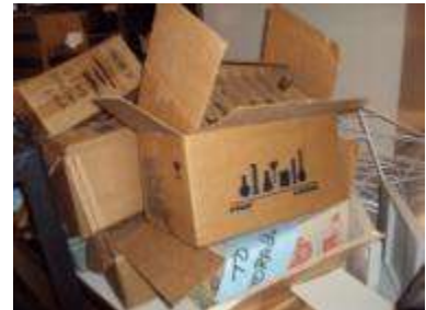
#154 – Pyrex labware