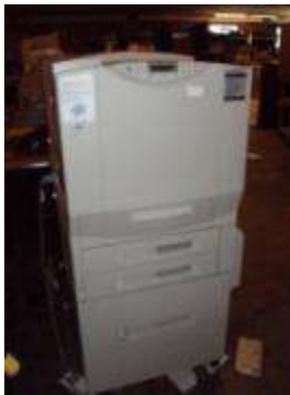
#61 – HP color Laserjet Printer