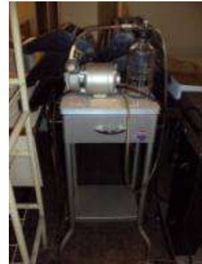
#81 – vacuum unit