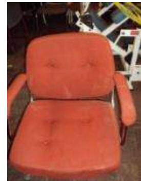
#102 – chair on wheels