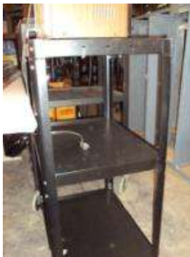
#54 – small media cart