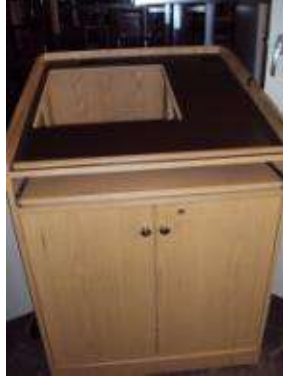
#146 Lg. Podium