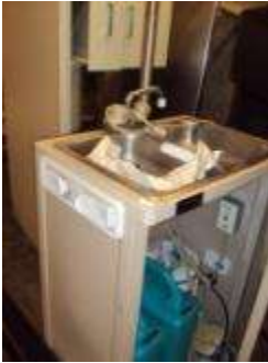
#164 – Portable sink