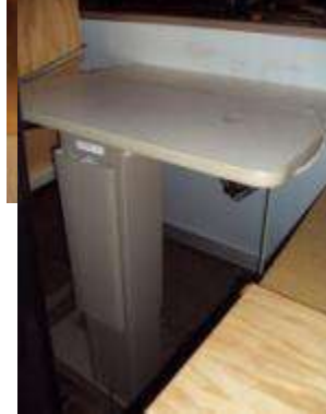
#93 – computer desk