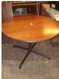
#68 – 41" Round table