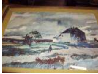
#27 - Scenic Painting