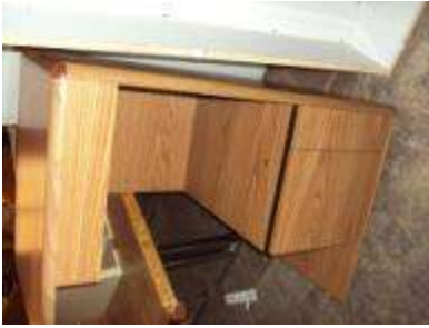
#72 – Small Wood Desk