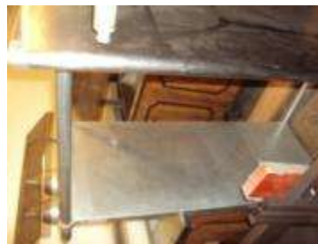
#168 – SS Table