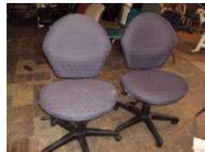
#99 – purple chairs