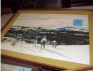
#29 – Scenic ski painting