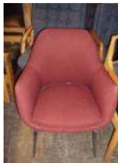
#98 – maroon chair