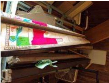
#149 – Pull-down map