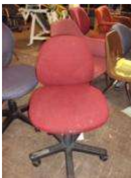
#100 – maroon comp. chair