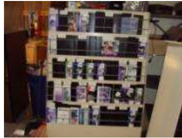
#43 – Flat pamphlet rack