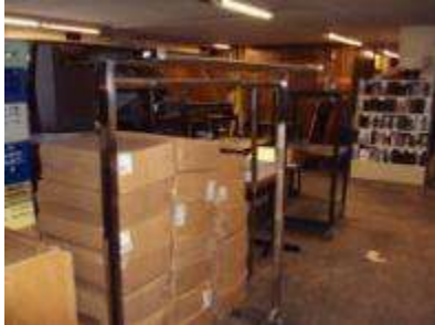
#92 – Metal garment/coat rack