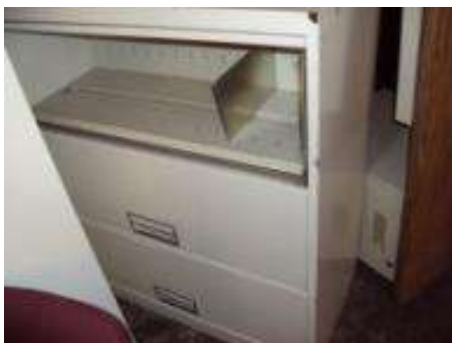
#143 – 3 drawer file