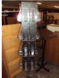
#30 – Plastic Pamphlet Rack