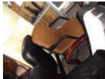
#120 – Brown Chair