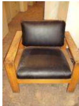
#101 Black leather/wood chair