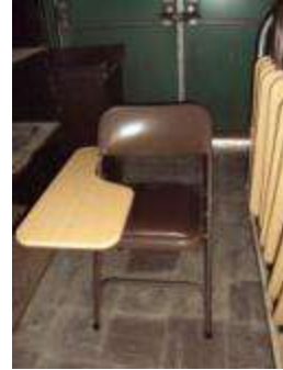
#74 – Chair w/tablet