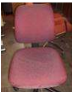
#104 – computer chair